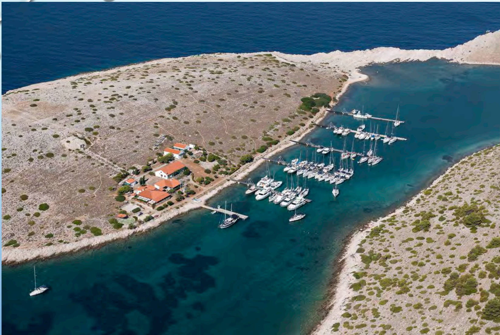
ACI marina Piškera