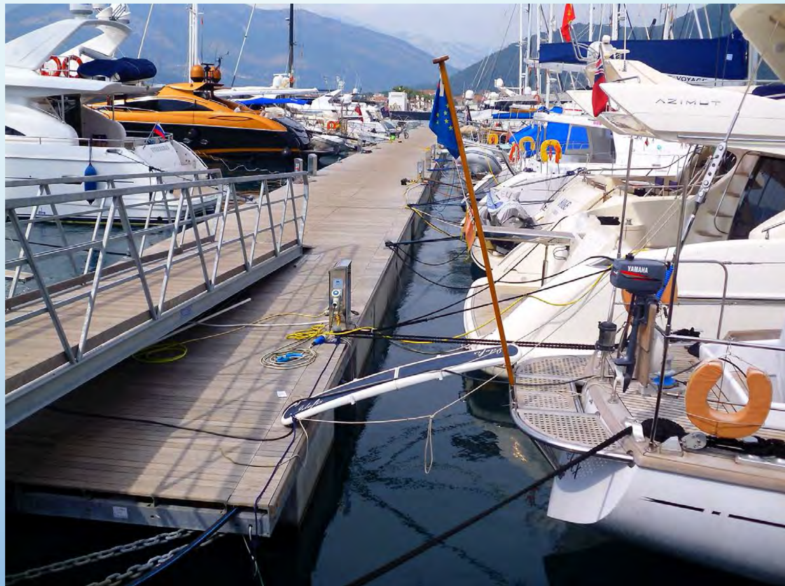
Porto Montenegro - Tivat