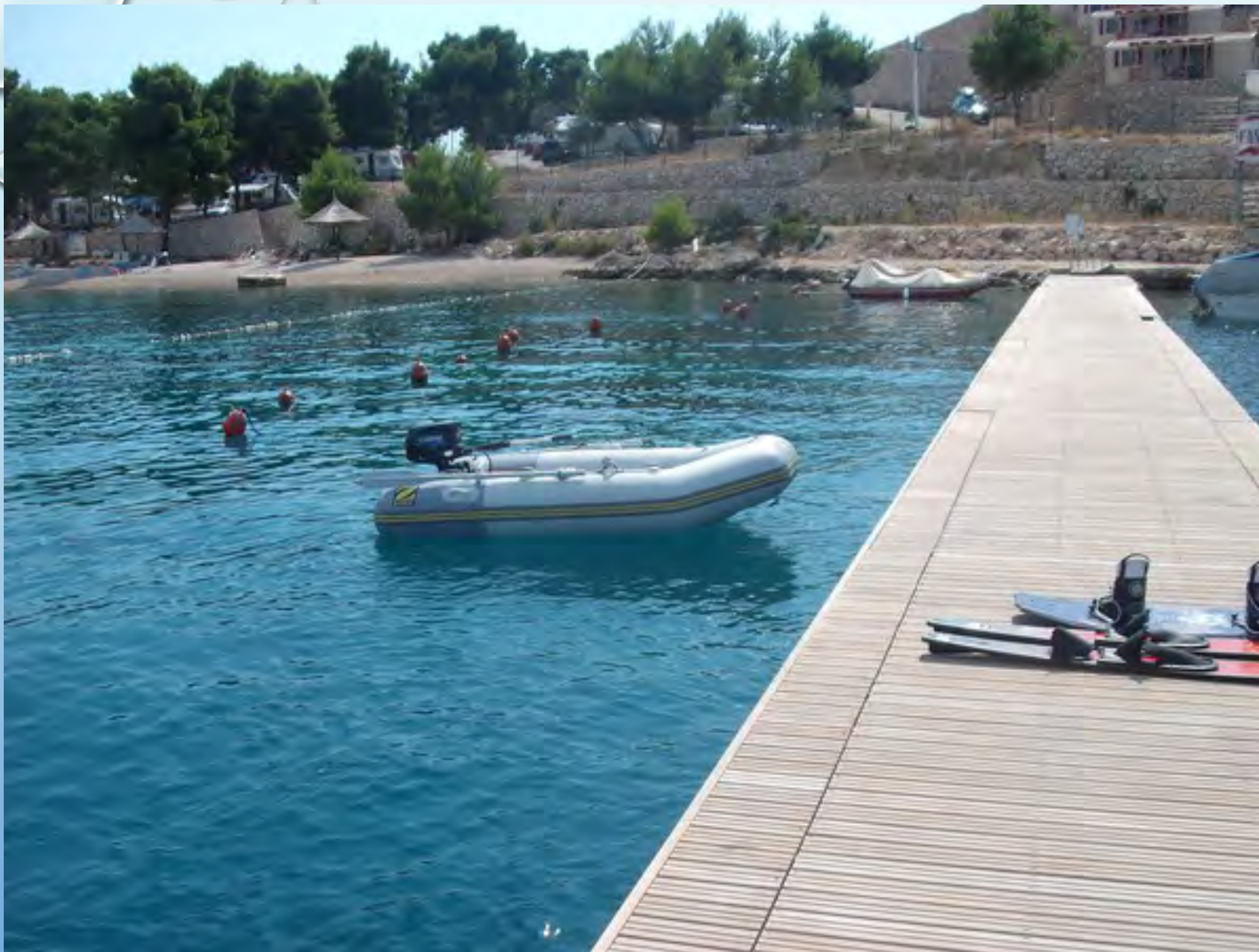
Auto camp „Oaza mira” - Drage