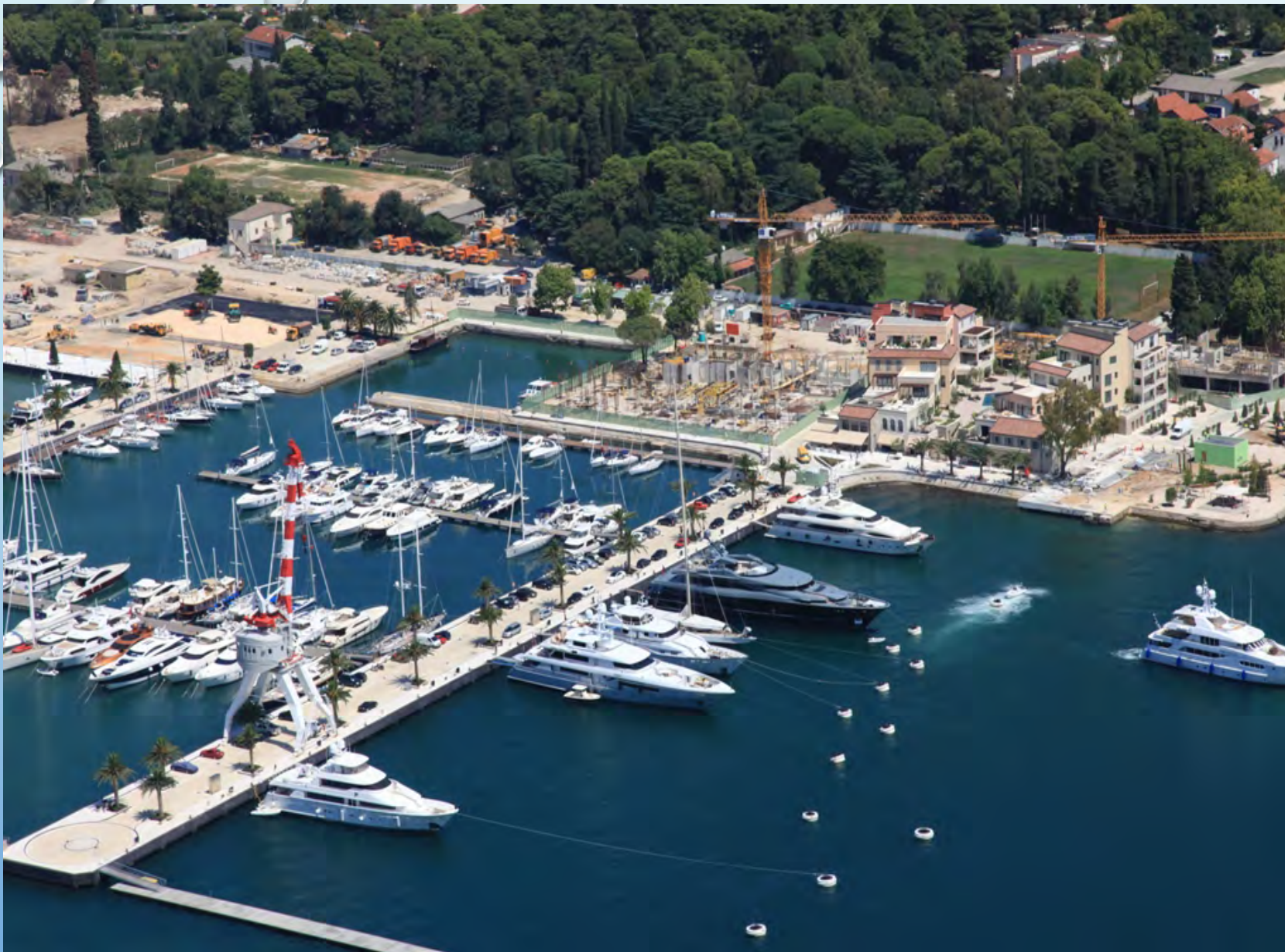
Porto Montenegro - Tivat