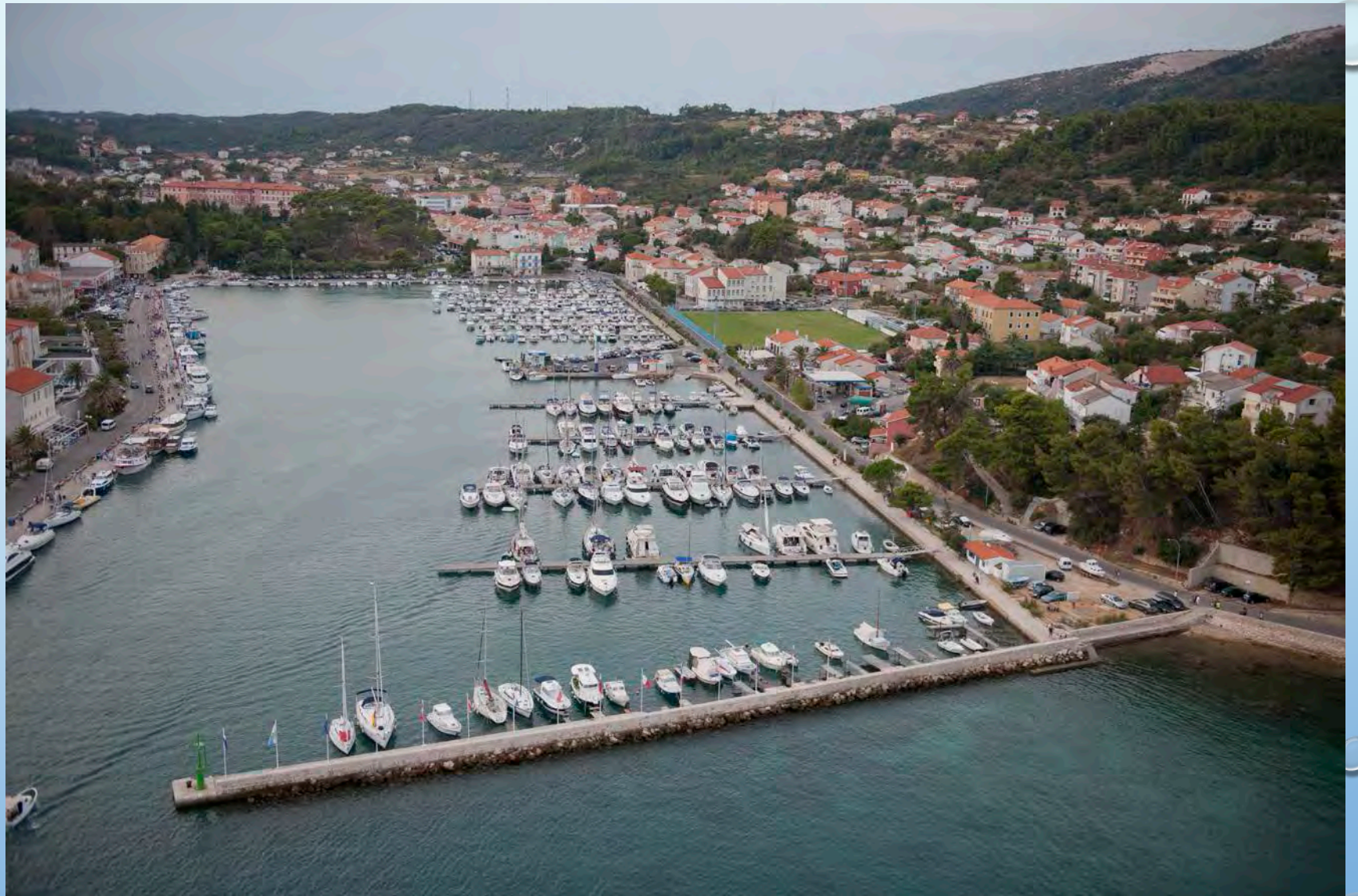
ACI marina Rab