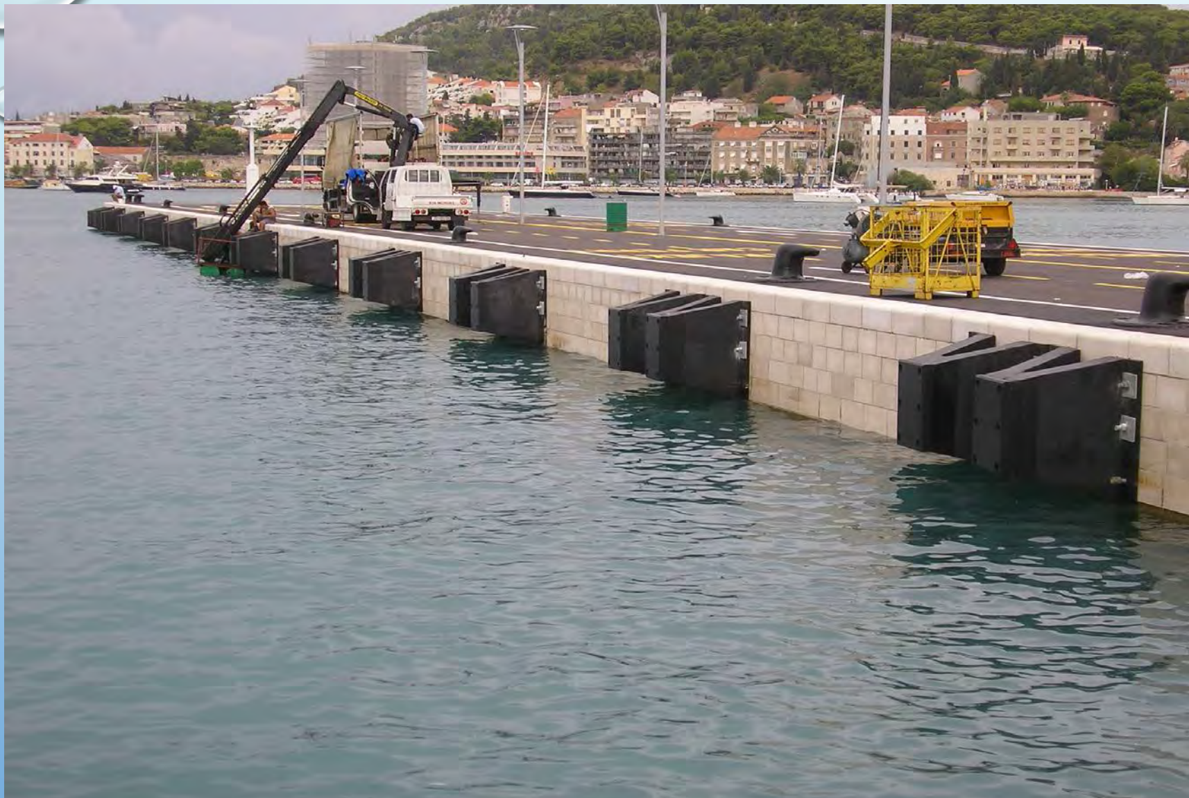
St. Peter Pier - Split