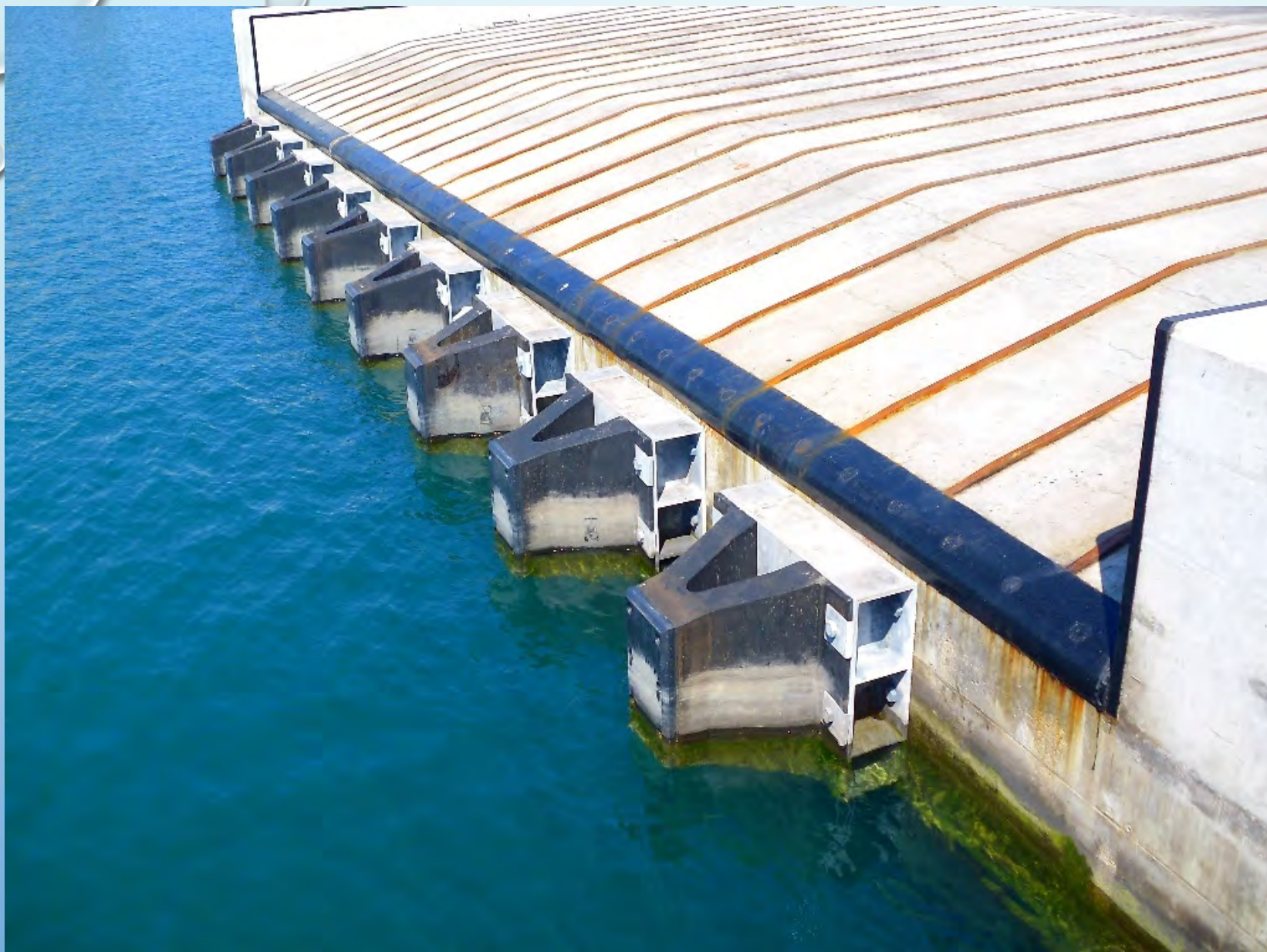
Ferryboat landing- Ploče