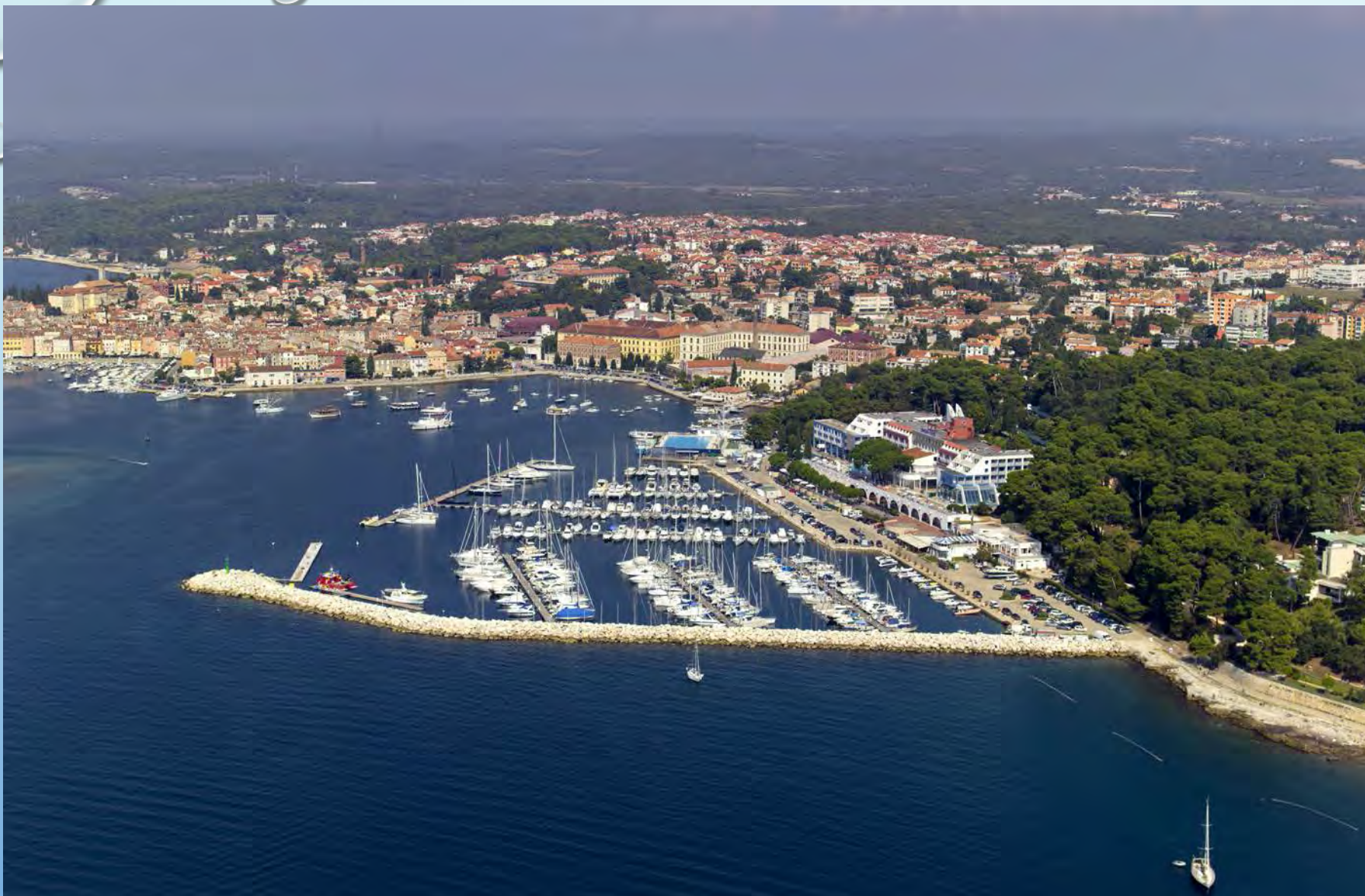
ACI marina Rovinj